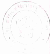
Vice - Chancellor Andhra University